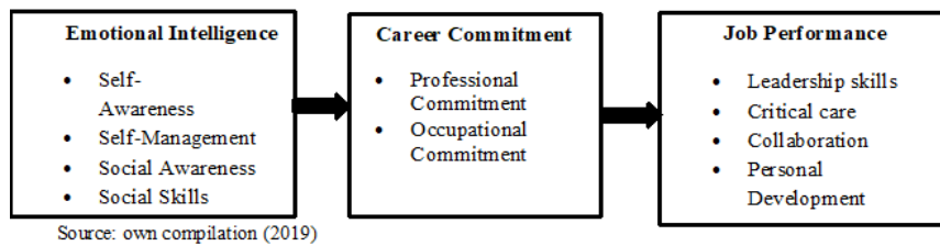
Figure 2.3 Conceptual Framework of the Study

Figure (2.3) presents the model of emotional intelligence, career commitment and job performance examined in this study. The model is comprised of three sets of variable emotional intelligence, career commitment and job performance. Emotional Intelligence is measured with self –awareness, self –management, social –awareness and social skills developed by emotional intelligence WLEIS (Wong & Law Emotional Intelligence Scale). Career Commitment comprised of professional commitment and occupational commitment. Job performance is determined leadership skills, critical care, collaboration and personal development.